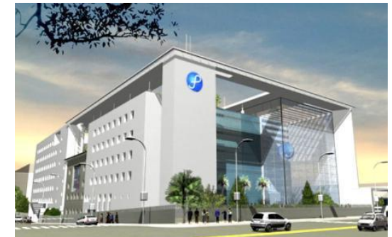
MIDC, Parsodi, Nagpur