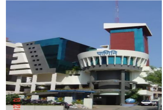
Senapati Bapat Road, Pune