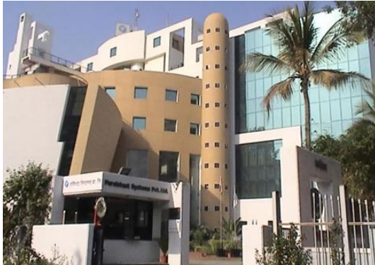
Senapati Bapat Road, Pune