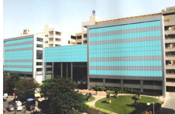
Karve Road, Pune