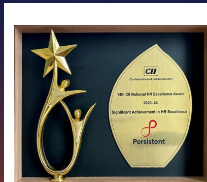
Recognized for "Significant Achievement in HR Excellence" at the 14 th CII National HR Excellence Award for the year 2023 – 2024

Named a Market Leader in the HFS Horizons: Assuring the Generative Enterprise™, 2024 Horizons study